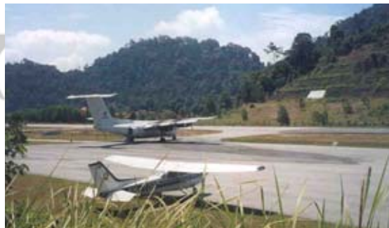
Pangkor Island Airport, Malaysia

number and is not intended to influence the actual runway length provided". In other words, the Aerodrome Reference Code is determined by the RFL for the critical aircraft to be used for operations. Since RFL is related to a specific atmospheric, environmental, and operational condition, the actual runway length required by the critical aircraft under different conditions may be more, or less, than the aeroplane RFL - but this operational need does not change the Aerodrome Reference Code to be applied for planning and design.