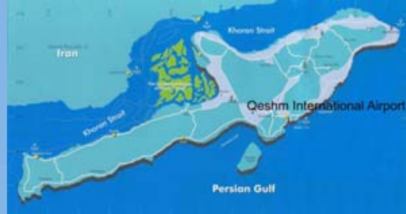
Qeshm Island in the Strait of Hormuz

Lying only 2km off the coast of Iran in the Strait of Hormuz, Qeshm Island is being developed as a major free trade zone for industry, commerce, tourism and duty-free shopping by the Qeshm Free Authority (QFA). A new airport opened in 1997, providing a 4200m runway and small terminal building. Industrial development has already commenced on the island, while the airport is to be expanded to support the island's economic growth, and to attract commercial and industrial activities to the site. Included among targeted land uses for the airport are an air cargo hub, bonded warehousing, aircraft maintenance, airport business park and financial centre.