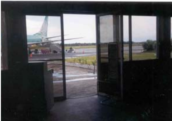
.....apart from being underexposed, of course!